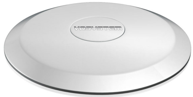
Designed in partnership with Spagnolo Srl

LONG TRANSMISSION RANGE IMPROVED OBSTACLES PERMEABILITY RESERVED BAND FOR SPECIFIC APPLICATIONS FREE BAND – NOT IN USE FOR CONSUMER TECHNOLOGIES IT'S EASY TO CREATE PERFORMING SYSTEMS. REGULATION 2005/928/CE – EN300-220